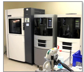
A Fortus and two Dimension printers in Acist's lab.

For more information about Stratasys systems, materials and applications, call 888.480.3548 or visit www.stratasys.com