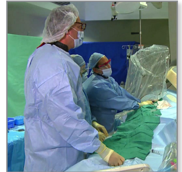
Physicians use Acist technology to view heart and arteries.

Acist recently updated its EmpowerCTA ® injection system, a lower-pressure injector. Thirty-six parts went into the new EmpowerCTA display, seven of which were FDM parts included in the marketed system. The product's FDM casing is as attractive as a molded case. FDM Technology enabled Acist to design for manufacturing in a new way by combining parts and building in additional complexity. This approach would have been impossible with traditional manufacturing methods like injection molding. Specifically, if Acist hadn't used FDM's additive manufacturing method, the seven parts that now complete the display would have been 15 — more than double the parts to manufacture and stock. Acist designed the FDM parts around the machined parts, circuit boards and integrated circuits to optimize design for manufacturing ability. A solid, tested design is important before moving on to mold and machine parts. FDM lets Acist produce small runs and get feedback from operators before committing to expensive production molds.