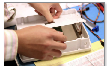
FDM enabled Acist to design this display assembly with fewer parts than were possible before.