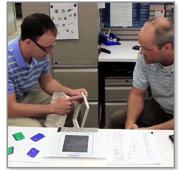
Acist team working on CTA monitor with FDM parts sprawled over table.