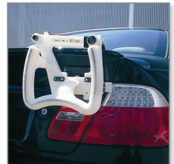
In the jigs and fixtures department at BMW AG, Regensburg, a Fortus system is used to manufacture assembly tools. This tool is used to affix the rear name badge.