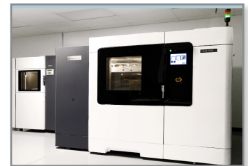
Fortus machines at Rapid PSI are used to make production parts for jet manufacturers worldwide.