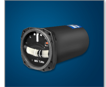
M3500 turn and bank instrument.

Achieving tight tolerances of 0.003 in. (0.0762 mm) FDM provides substantially better dimensional accuracy than the urethane casting process, and it eliminates the need for hand sanding. The temperature rating and burn data for ULTEM 9085 substantially