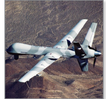
For the Department of Defense, the TDF designs and builds "trainers" and "training aids" such as UAV replicas to train students.

Before settling on FDM, the TDF considered "a multitude" of the other additive processes, says Weatherly. "With FDM, the investment is up front, not ongoing," he says. "The parts are durable, and they have the high level of detail we require. In