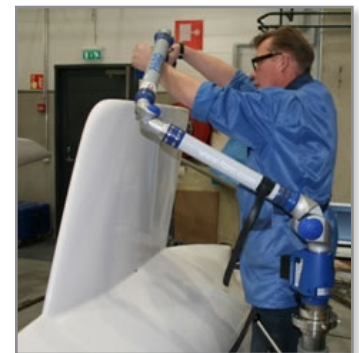
The TDF often reverse engineers components to make the replicas.