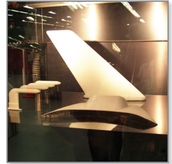
Antenna and other components being manufactured by a Fortus FDM machine.

[Editors' Note: The TDF (Trainer Development Flight) has won the 2008 Air Force Chief of Staff Team Excellence Award for its use of FDM technology and other advanced production methods. It is recognized as the premier center of excellence for manufacturing trainers and training aid products for the Air Force and other required Department of Defense agencies.]